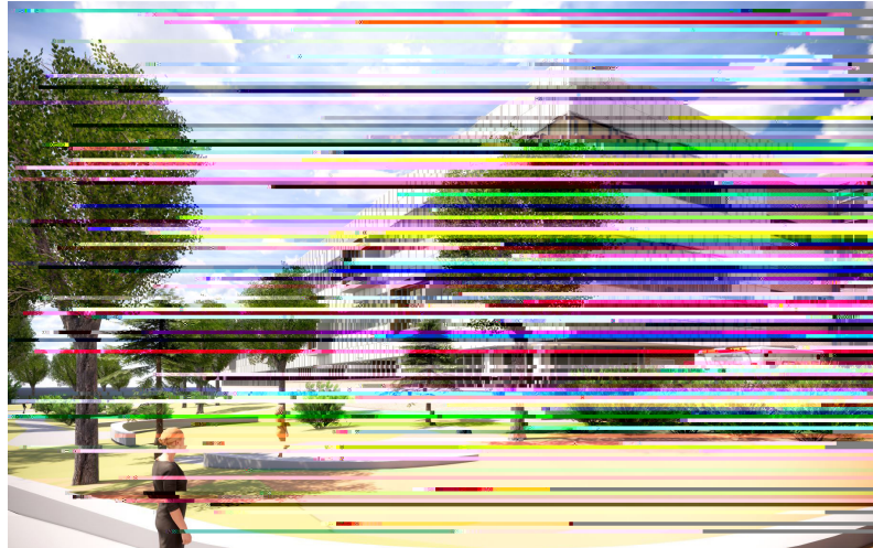
Head Lease Building - New