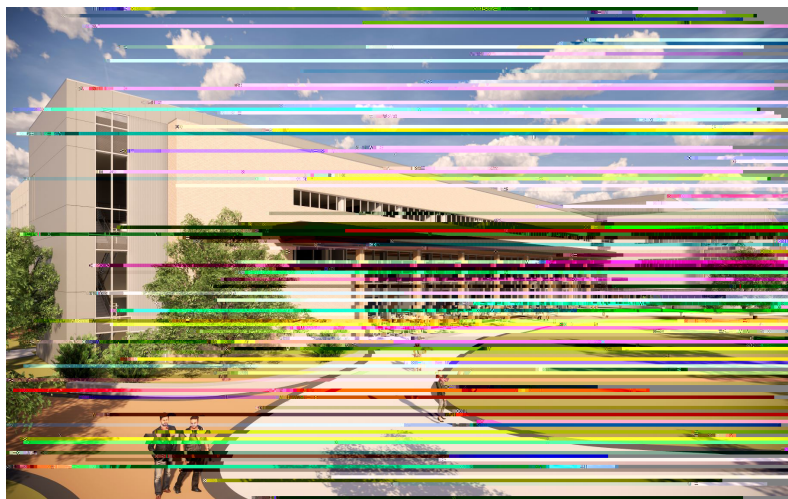
Head Lease Building - South